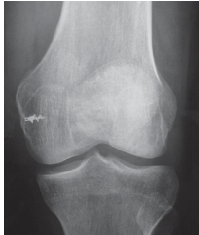
Figure 3 - Frontal plane X-ray of the knee showing metallic anchor used for MPFL fixation

The first authors to describe a case series were Boring and O'Donoghue (20) reporting their experience with the surgical approach for acute patellofemoral dislocation in 17 patients. In nine patients, they associated the medialization of the patellar tendon to