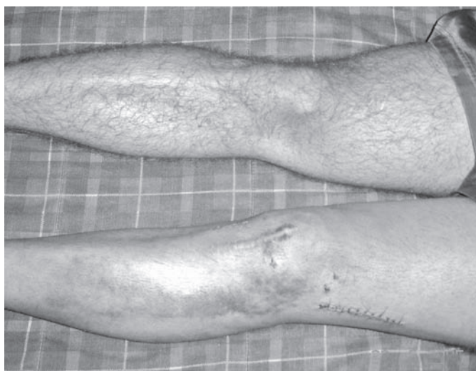
Figure 2 – Photography of the lower limbs demonstrating the surgical scar in the postoperative period of the ligation of the lateral superior genicular artery.