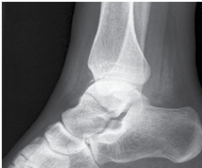
Figure 1. Lateral radiograph of ankle, exemplifying the images used during the evaluation (DOT-HC/Unicamp).

The cases were collected retrospectively, excluding pathological fractures, associated malleolus fractures or patients with deformities in the ankle secondary to other pathological processes. The evaluations were carried out in an auditorium, with the classification presented to the survey participants by an orthopedic surgeon. Afterwards, a copy of Hawkins' original article was distributed for reading and reference during the evaluation. During the evaluation process, all the participants also received a schematic drawing of the classification. (Figure 2)