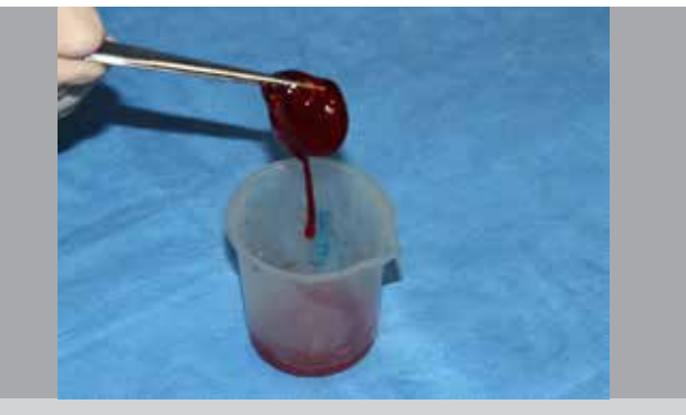
Figure 2. Platelet rich plasma clot activated with autologous thrombin and 10% calcium gluconate.