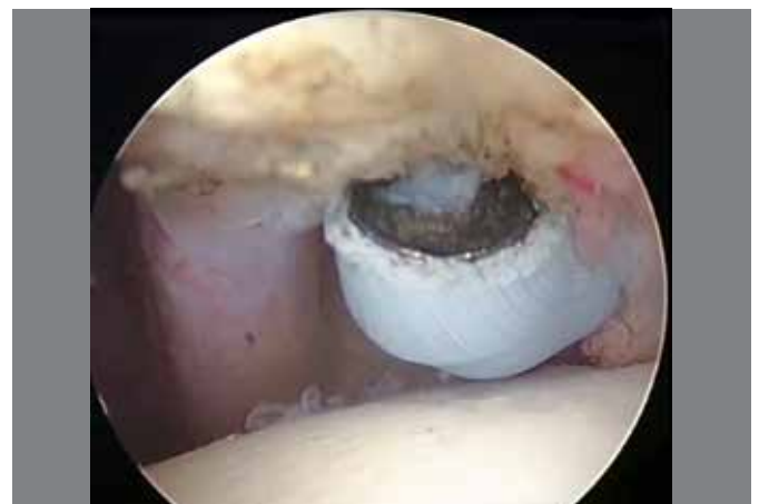
Figure 1. Release of rotator interval in left shoulder. Scope was inserted from posterior portal and radiofrequency probe was inserted in anterior portal.