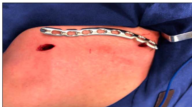
Figure 2. Measurement of plate size and percutaneous pathway access.

In the period studied, 17 patients were operated with the MIPO with locking technique. We excluded two patients due to loss of follow-up, thus remaining 15 patients as the object of analysis. No case required conversion of the closed to open technique. Most patients were male (93%) and had fractures on the left side (80%). The mean age was 31.8 \pm 12.7 years. According to the