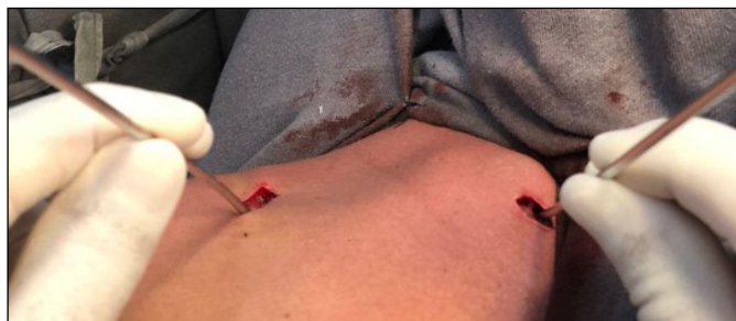
Figure 3. Intraoperative image of the joystick technique to indirectly reduce the fracture.