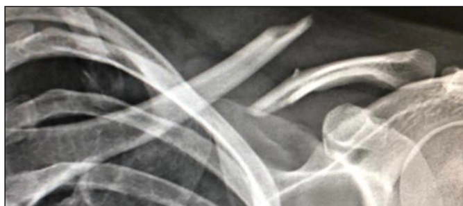
Figure 1. Complete transverse and displaced fracture of the middle third of the clavicle.

All patients initiated pendulum movements, encouraging active and passive movement in the immediate postoperative period. Patients started physical therapy after six weeks, twice a week. In total, 20 sessions were performed, the last ten with resistance active exercises. Radiographic evaluation was performed with anteroposterior (AP) radiographs, cephalic inclination of 45°, and caudal of 45° of the clavicle at two and six weeks, and at three, six, and 12 months after the surgery. Fractures with at least three integrated corticals were considered consolidated. Absence of fracture healing after three months was considered a delay in fracture healing, and at six months, pseudarthrosis.