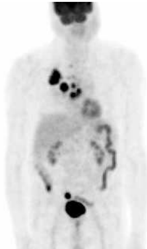
Figure 1 - 82 year old male presented for staging of lung carcinoma, was found to have two abnormal areas of FDG uptake in his colon. Following colonoscopy the focus in the sigmoid colon was a 3cm tubulovillous adenoma, the focus in the cecum was also found to be a tubulovillous adenoma.