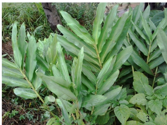
Figure 3. Habitat of collection of Plaumanniana trigemmis , with possible host plants including Hedychium coronarium J. König (Zingiberaceae).