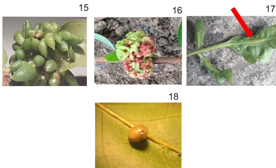
Figures 15-18. Insect galls from the Botanical Garden of the Museu Nacional, Rio de Janeiro (RJ, Brazil): 15-16: on Myrtaceae: 15. Conical galls on Eugenia uniflora L.; 16. Bud gall on Myrcia selloi (Spreng.) N.Silveira; 17. Leaf gall on Serjania sp. (Sapindaceae); 18. Bud gall modified by inquiline on Eugenia florida DC. (Myrtaceae).