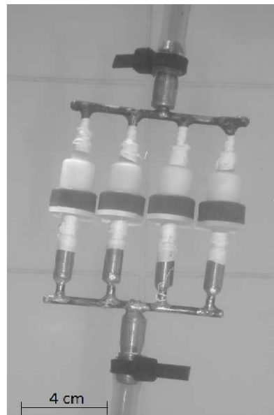
Fig. 1. Metal adaptors with Sep-Paks ® in test pool and in situ allelopathy experiment.

Before the field experiment, the apparatus were previously tested in a pool by using ink to verify the rate of flow of water moving through Sep-Paks ® columns. The substances collecting apparatus were powered by compressed air from a SCUBA tank, whose flow was controlled. A knife was used to cut the colonies inducing an artificial release of chemical compounds in the water following the methods of SCHULTE et al. (1991). The apparatus collected the substances around the species of each replicate during 4-5 hr. The forty Sep-Paks ® columns were activated using MeOH solvent before the field experiment. Each colony sampled used four Sep-Paks ® columns to capture the substances (see Fig.1) which were pooled into a replicate (n=5 replicates) for subsequent analysis. After each sampling the columns were eluted with 60 mL distilled water, 60 mL MeOH and 60 mL DCM. The MeOH extracts were washed with DCM and the DCM extracts were combined. The differences between control and treatment extracts were detected by GC-MS.