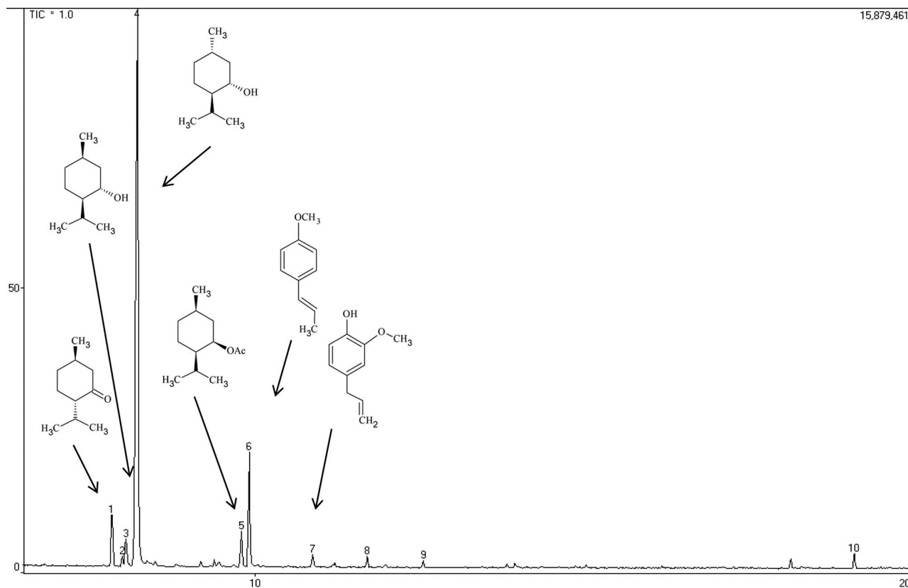
FIGURE 2 - Chromatogram obtained from gas chromatography of the non polar fractions obtained from Periogard ® . The determination of structures was performed with a mass spectrometer, and the results were compared with the NIST ® library as follows: menthone (retention time 1=7.82 min), menthol (retention time 3=8.03 min), isomenthol (retention time 4=8.21 min), menthyl acetate (retention time 5=9.79 min), trans anethol (retention time 6=9.91 min) and eugenol (retention time 7=10.88 min).