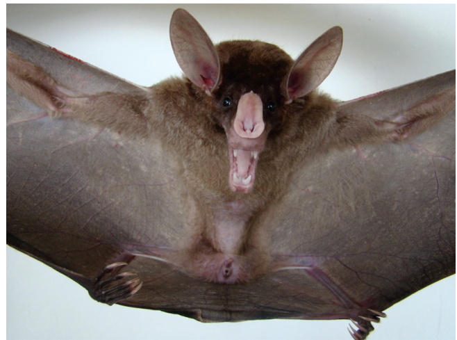
Figure 1. Vampyrum spectrum (Phyllostomidae) captured in the Nhumirim farm, Southern Pantanal, Mato Grosso do Sul, Brazil.

The records of V. spectrum reported in the upper Paraguay basin were obtained in forest habitats. Vieira (1955) collected one specimen in riparian forest, and Acosta & Azurduy (2006) collected two specimens at the border of a forest corridor associated to cultivated pasture areas. Our records were obtained in the typical Pantanal "cordilheiras", which are interconnected forest corridors and patches located in non-floodable terrain. These records, therefore, support that V. spectrum is able to