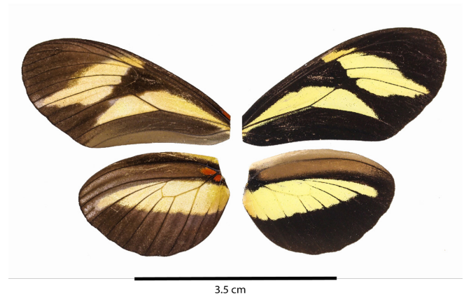
Figure 2. Heliconius nattereri (male) ventral (left) and dorsal (right) sides. Collected on 7.IV.2017, Mata do Timbó, Amargosa, BA.

Our finding opens the possibility of finding other undiscovered populations nearby and further to the south, although habitat destruction may make this search fruitless. We are also able to report that the butterfly was seen flying in 2016 at Serra Bonita Reserve in Camacan, Bahia, located 250 km away to the South, approximately midway between the Amargosa