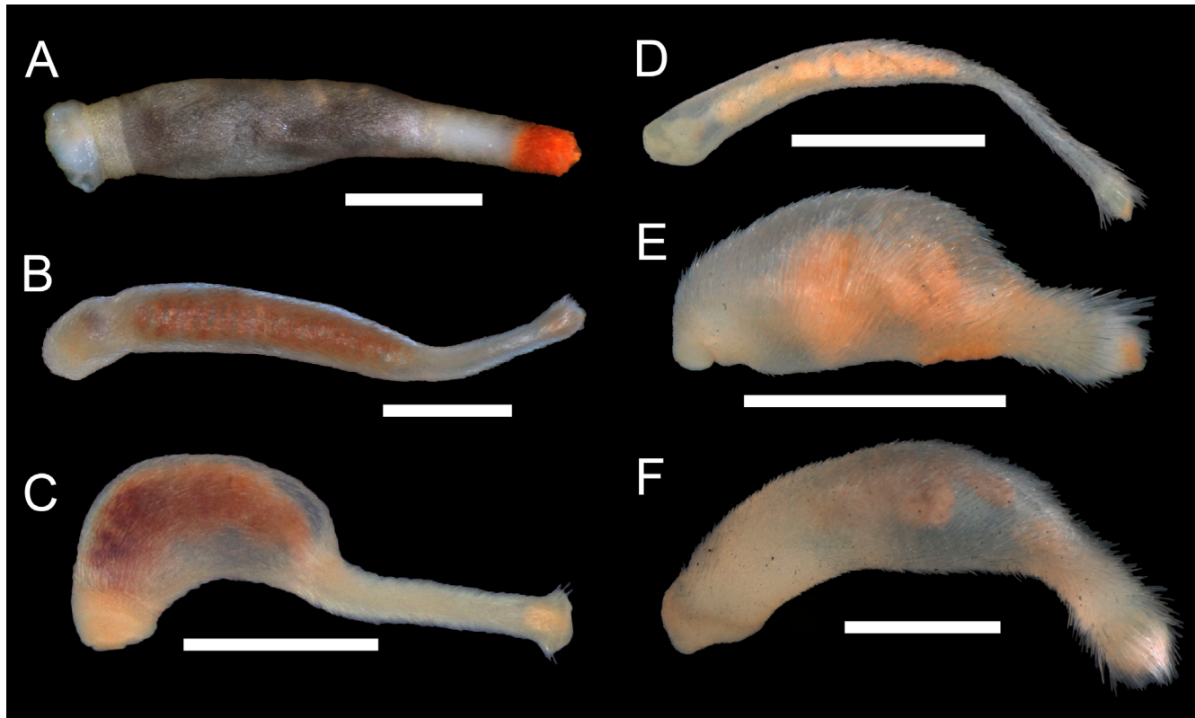
Figure 2. Caudofoveata species from Campos Basin, southeastern Brazil. A and B are F. targatus and F. acutargatus , respectively, recorded by Corrêa et al. (2014); C is F. australocaudatus (Passos et al. 2017); and D-F are C. amplum , C. crassum , and C. virium , respectively (Corrêa et al. 2018). Scale bars = 1 mm.

genus known from the Atlantic Ocean. Through these comparisons, they noted that species with similar body forms and with sclerites of the same shape occur off the western and eastern Atlantic coasts; these similarities could suggest that these species are sister-groups, sharing the same morphological traits as a result of common ancestry. Corrêa et al. (2014, 2018) and Passos et al. (2017) can be considered as the only more complete studies made on Brazilian aplacophorans, adding detailed data about the structure of the sclerites and radula, as well as about the external morphology and the bathymetric distribution of caudofoveates from Brazil. In Figure 2, all these species recorded by Corrêa et al. (2014, 2018) and Passos et al. (2017) are illustrated.