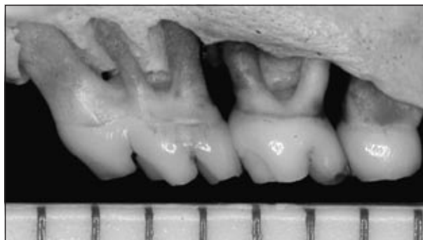
Figure 2 - Morphometric analysis: linear measurement from bone crest to cemento-enamel junction.

Ten maxillary sides (test and control sides) were defleshed after immersion in 8% sodium hypochlorite (Q'boa®, Osasco, SP, Brazil) for 4 hours. The specimens were washed in running water and immediately dried with compressed air. To outline the CEJ, 1% methylene blue (Sigma-Aldrich®, Saint Louis, MO, USA) was applied to the specimens for 1 minute. Photographs were obtained with a 6.1-megapixel digital camera (Nikon® D100, Ayutthaya, Ayutthaya, Thailand) on a tripod to keep the camera parallel to the ground at the minimal focal distance. The specimens were fixed in wax and kept with their occlusal plane parallel to the ground and their long axis perpendicular to the camera. Photographs of the buccal and lingual aspects were made. To validate measurement conversions, a millimeter ruler was photographed together with all specimens. The ImageTool® software was used by an observer blinded to the group to which the slide belonged to obtain