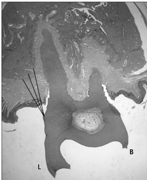
Figure 1 - Histologic analysis: linear measurement from bone crest to cemento-enamel junction. B : buccal side; L : lingual side.