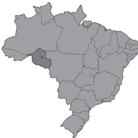
Figure 1 - The state of Rondônia (shaded) and Monte Negro (black dot).

Monte Negro (Fig. 1) is a small village in the state of Rondônia in the Western Amazon region of Brazil. It is located approximately 250 km away from the state capital Porto Velho, with a population of 12,086 inhabitants, 60% of which live in the rural area. Since 1997, a nucleus for field studies of the University of São Paulo (USP) has been installed in the village of Monte Negro, when a new family-health program was implemented with technical assistance from USP. In December 2000, the village was visited by the "Bandeira Científica", a program sponsored by the Medical School of the University of São Paulo (FMUSP) for student training in rural assistance, during which health counseling and research activities were conducted in addition to health assistance to the population. The present study refers to one of these research activities.