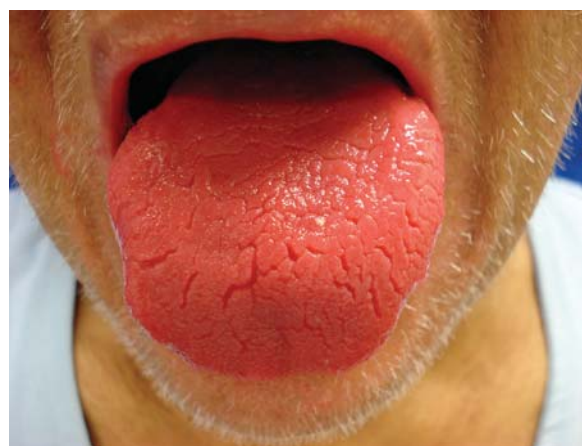
Figure 2 - Angular cheilitis and a depapilated bright red tongue

negative. An elevated level of blood glucose (125mg/ml) was observed. The patient's plasma level of glucagon was greater than 1,280 pg/ml (normal range: <60 pg/ml).