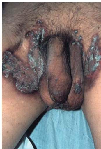
Figure 3 - Erythematous scaling and crusted plaques, with exulceration on the edges of the lesions, involving the groin and genital areas

Histopathological examination of a purpuric skin lesion