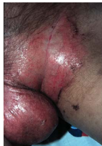
Figure 1 - Erosive scaling and crusted patches on the genital and groin area

Laboratory testing showed normocytic normochromic anemia and slightly elevated levels of amylase and lipase. The patient had normal levels of serum zinc, folic acid, vitamin B12, albumin, globulins, alanine and aspartate tranferase. Hepatitis B and C and HIV serologies were