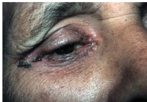
Figure 4 - Erythematous scaling and crusted plaques, with exulceration on the edges of the lesions, involving the periorbital area