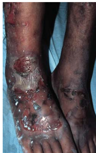
Figure 5 - Tense bullous lesions with purulent content and pellagroid eczematous plaques on the anterior surface of the legs and feet, associated with purpura and edema

showed extravasated erythrocytes on the superficial dermis and hyaline thrombus on the vascular lumen of on the deep dermis. These findings were attributed to the medication taken by the patient.