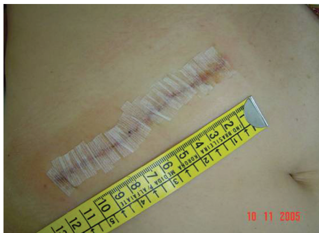
Figure 1 - The mini subcostal approach for donor nephrectomy: An incision of 10 cm is made about 3 cm below the last costal arch in the right flank.

In procedures involving the right kidney, the renal vein was cut near its insertion in the lower cava vein, and a direct 4-0 polypropylene suture was used for vena cava repair. On