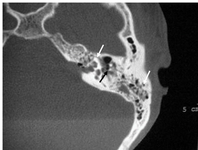
Figure 1. Axial High-resolution Computed Tomography showing longitudinal fracture line passing through the geniculate area (white arrow) and incus dislocation (black arrow) in left temporal bone

Caption: FNP- Facial Nerve Paralysis; H-B grading - House-Brackmann grading; R - Right; L - Left; M - Male; F - Female; RTA- Road traffic accident; AF - Accidental fall; DM- Diabetes Mellitus