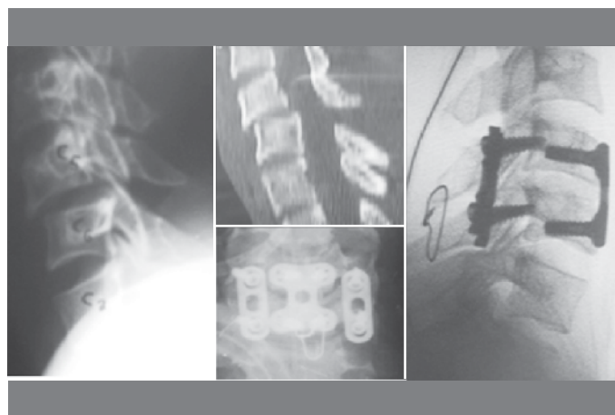
Figure 2. Thirty-one-year-old patient with AO-ASIF fracture type B1.2 at C5-C6 level.

Patients were followed up for a period of one to four years. Complete reduction of the fracture dislocation of the lower cervical spine was observed in 28 patients (82.35%) using only the anterior approach and open reduction. (Figure 1) Closed reduction with cervical traction was not used in any patient. A triple approach (anterior-posterior-anterior) was required in order to reduce the fracture dislocation in six patients (17.65%) (Figure 2), six of which were fractures classified as type B1.2. Complementary fixation was necessary through a posterior approach in seven patients (20.58%). Six corpectomies were performed. No patient developed a neurological deficit. The late complication that occurred postoperatively in four patients (11.76%) evolved with a superficial surgical site infection (all via a posterior surgical approach) and in two patients (5.88%) hematoma of the surgical site occurred in the immediate postoperative period.