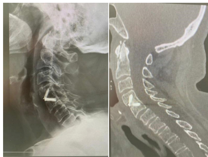
Figure 2. Left lateral radiograph at the ninth postoperative month and sagittal CT scan of the same patient in Group 2 showing bone healing.

Arthrodesis with anterior cervical decompression is one of the most widely used surgical treatments for patients with cervical