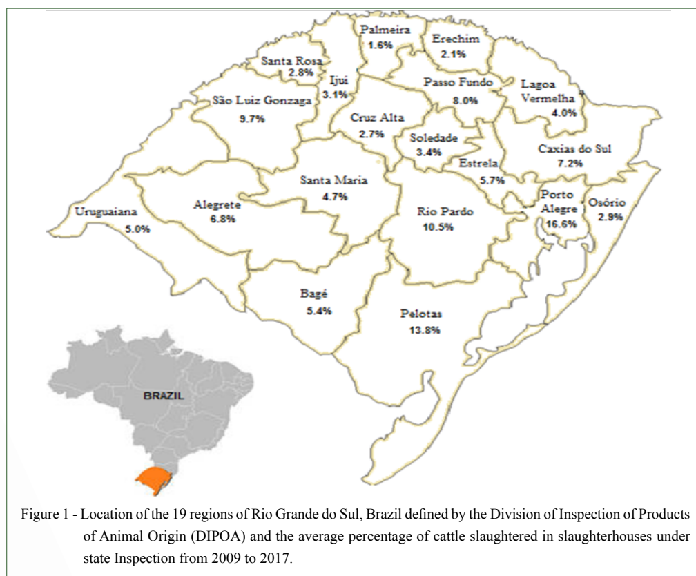
Figure 1 - Location of the 19 regions of Rio Grande do Sul, Brazil defined by the Division of Inspection of Products of Animal Origin (DIPOA) and the average percentage of cattle slaughtered in slaughterhouses under state Inspection from 2009 to 2017.

The infection rate for the three diseases had little variation over the nine years evaluated (Table 1), demonstrating the presence and maintenance of the pathogens in the cattle herd of Rio Grande do Sul. Mean infection rates are presented according to the origin of the animals, regionally (Figure 2). One can observe the presence of the three infectious agents in all regions but occur at varying levels between them. Hydatidosis was detected at higher levels in cattle from Alegrete, Bagé, and Pelotas regions. Cysticercosis was observed more frequently in animals from the Santa Maria, Osório, and