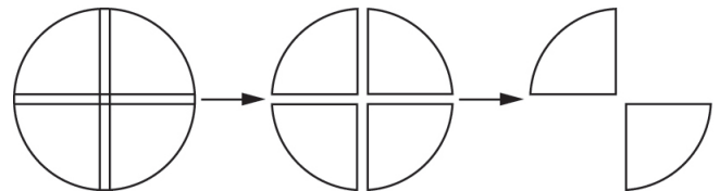
Figure 2. Landrace pumpkins quarterization.

To determine the amount of total carotenoids, \alpha - carotene, \beta -carotene, and its Z isomers in the raw and cooked pumpkin samples, approximately 0.300 g of the samples and 3.0 g of celite 454 (Tedia, Ohio, USA) were weighed in a mortar on a digital balance (Bel Engineering, model MA0434/05).