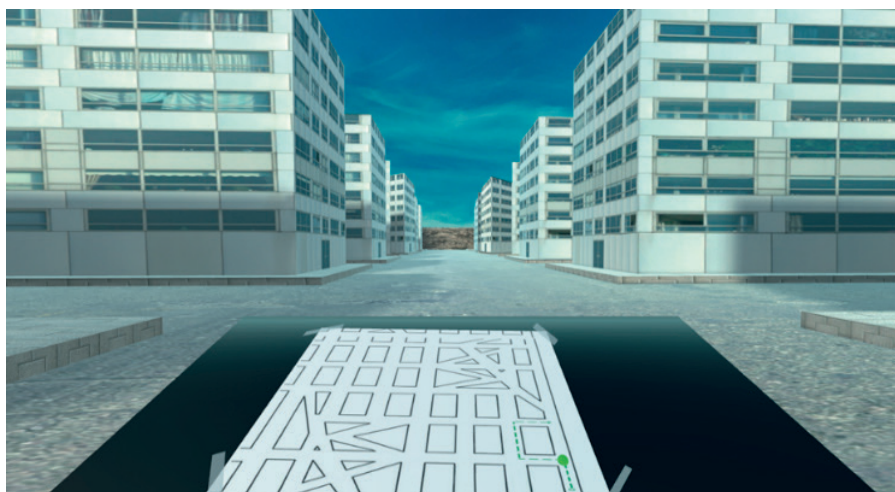
Figure 1. Participant's view in practice trial of SOIVET-Maze.

Participants could not choose a wrong turn more than three times, and each mistake led back to the last turning point. All participants were able to perform a practice trial prior to task performance and to repeat the task once. The scoring system was based on the total of correct turns of participant's last trial performance. Akin to the MRMT scoring system, the maximum possible score is 32 points. There was no time limit.