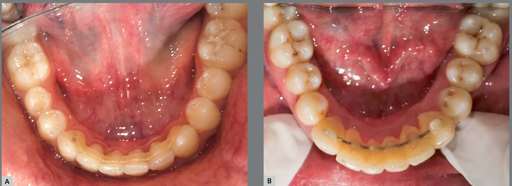
Figure 2: A) Fiber-reinforced composite retainer bonded on the lingual surface of mandibular anterior teeth. B) Multistranded stainless steel wire retainer bonded on the lingual surface of mandibular anterior teeth.

The subjects were called back at every three months interval, for a period of 12 months: three months (T1), six months (T2), nine months (T3) and twelve months (T4). At every visit, the following indices were evaluated on each subject, by the principal investigator and then was reevaluated by two colleagues to avoid errors, and the mean value was recorded.