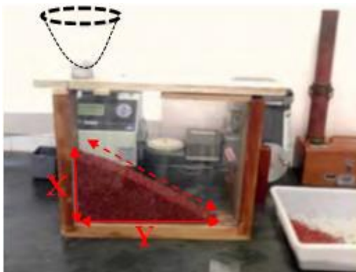
FIGURE 2. Wooden framework for measuring the seed angle of repose.

To understand the flowability of the seeds characteristic that influences the flow capacity within the metering system, we determined the sorghum seeds angle of repose according to the methodology described by NUNES et al. (2014). The angle was determined using a rectangular box constructed of glass and wood (Figure 2). The sorghum seeds were drained at a constant speed through a funnel fixed in a lateral opening of the box, forming a pile. With the aid of metrics rules placed in the vertical and horizontal in the box, we measured the height of the seeds in the X axes and flow length in the Y axis.