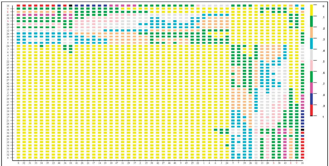
Figure 3. Graphical representation of dissimilarity based on the Mahalanobis distance (" D^2 = |ii'|^{-2} ") among 50 okra hybrids. The numerals indicate the pre-commercial hybrids UFU-QB; S, E, and V represents commercial hybrids Speedy, Esmeralda and Veloce, respectively. The colors present in the graph symbolize the variability from 0 to 1, where 1 represents the most genetic divergence. Monte Carmelo, UFU, 2016.

55 and 3096 g per plant. In general, earlier hybrids were less productive. Reddy et al. (2012, 2013) reported lower values for these traits in okra hybrids in India, mainly in relation to productivity, with values ranging from 202.46 to 345.28 g per plant (2012) and 244.67 to 414.74 g per plant (2013). On the other hand, okra productivity ranging from 194.11 to 1049.30 g per plant was found by Mattedi et al. (2015) in Brazil; and between 313.3 and 6698.7 g per plant by Binalfew & Alemu (2016) in Ethiopia. These results demonstrate the great divergence that can exist in an okra bank germplasm, besides the difference of performance of genotypes in the diversified environments.