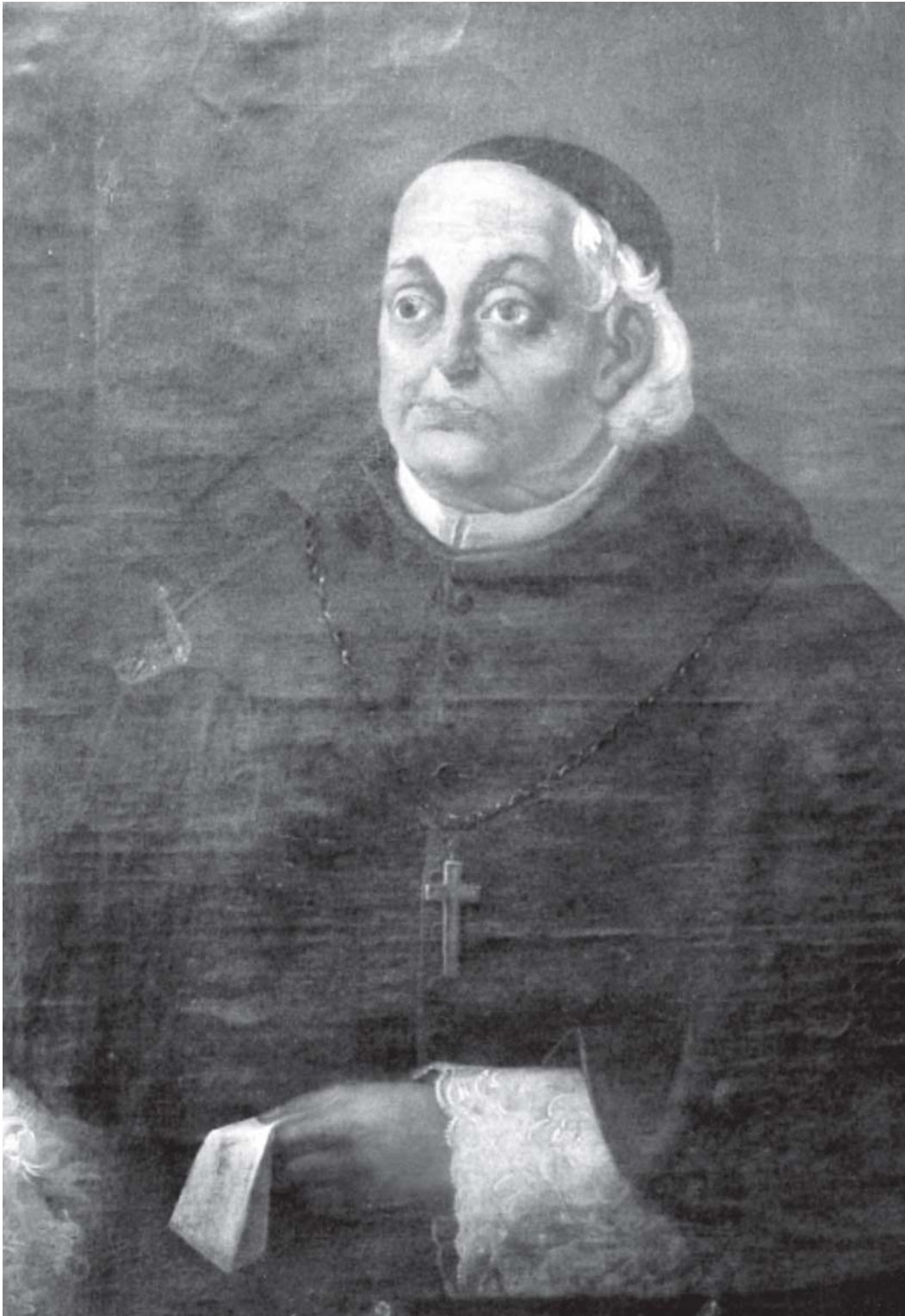
Figure 1: The Most Reverend Dom Frei Cipriano de São José, undated, author unknown.