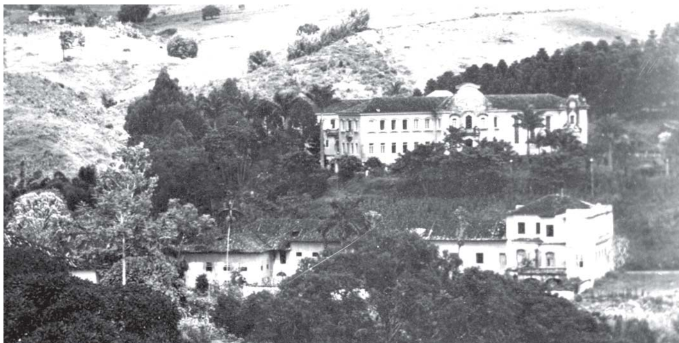
Figure 4: Former Bishops' Palace in Mariana with Maiores São José seminary in the background, undated, author unknown (private collection of Maria da Glória Celestino)

Vasconcelos's (1947) text was written at a time when the former Bishops' Palace was "in ocium cum dignitate and seems doomed to ruin" (p.69-74). Later, the building housed the archdiocese's printing works, which published not only ecclesiastical pamphlets, but the renowned Folhinha de Mariana with its weather forecasts. Meanwhile, Vasconcelos's predictions about the prospects for the building came true when part of it collapsed at the end of the 1990s.