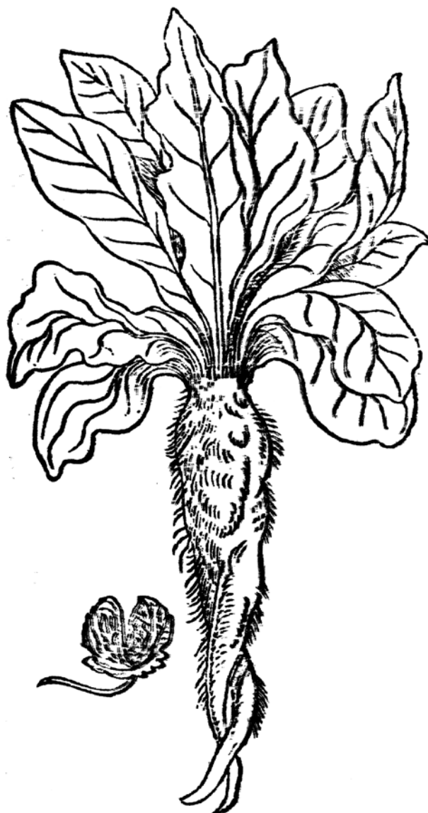
Figure 1: Male mandrake ( Mandragora mas ) (Dioscorides, 1553, p.273)

Prior to Denys’ work, a number of books explored the botany of Nouvelle France, including André Thévet’s Les Singularitez de la France Antarctique (1536) (tr. The New Found Worlde, or Antartike , 1568); Gabriel Sagard’s Le grand voyage au pays des Hurons (1632) (tr. The Long Journey to the Country of the Huron , 1930); and Cornuti’s Canadensium plantarum, aliarúmque nondum editarum historia (1635). It must be pointed out that the doctrine of signatures put forward by the Swiss physician, philosopher, and alchemist Paracelsus presupposed that there was a relation between the shapes, colors, and virtues of plants and the organs of the human body (Figure 1). In the Middle Ages, botany texts were accompanied by fanciful illustrations like that of the mandrake root, whose structure and properties were associated with the human body. Furthermore, properties were