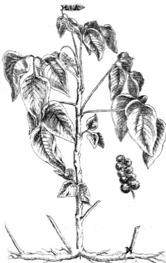
Figure 5: Edera Trifolia canadensis (Cornuti, 1635, p.97)