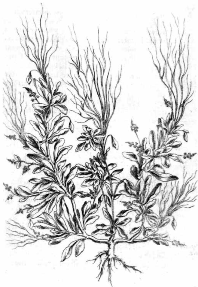
Figure 2: Canadian plant (Cornuti, 1635, p.9)

The contribution of the Jesuit physician Cornuti – Canadensium plantarum (1635) – pleased Charlevoix for a number of reasons (Figure 2). In addition to appreciating the compilation itself, there is the fact that this author reconstructed, at a distance, a botanical history of transmigrated species that could be found in the main French gardens of the day. In these studies, description and artistic representation seem to move in one same direction – that is, they are characterized by observation and detailing. The priest Charles Plumier also appreciated the pioneering study that Cornuti conducted