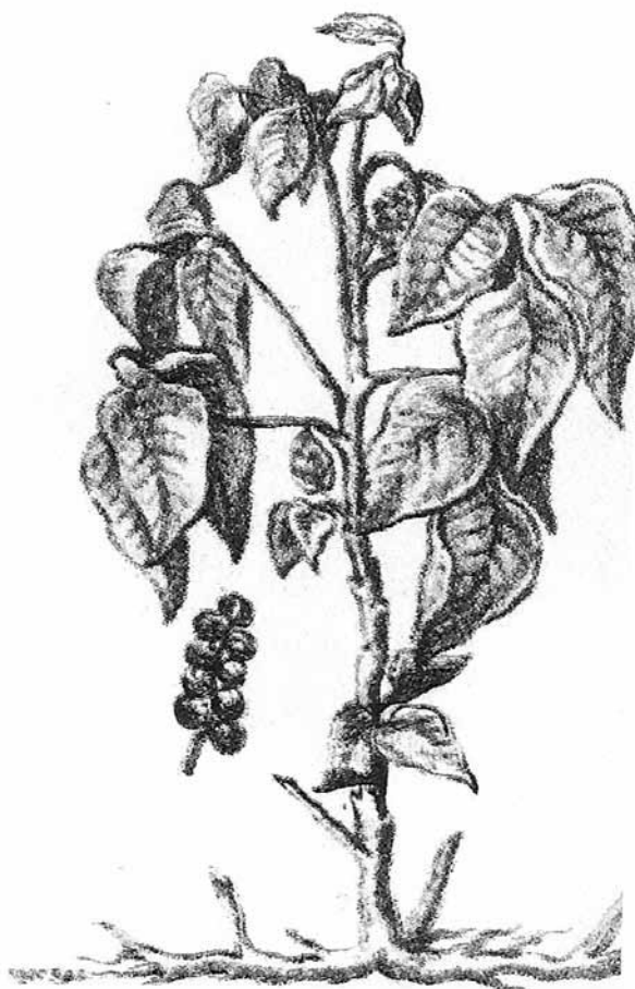
Figure 4: Edera Trifolia canadensis (Charlevoix, 1744, p.31a)