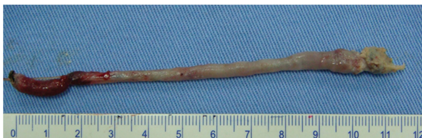
Fig. 3 Macroscopic view of the polyp.

Obviously, a definitive diagnosis is accomplished only by histopathologic evaluation. Histologically, FVPs present a mixture of fibrous elements, adipose tissue, and blood vessels, surrounded by normal squamous epithelium. 5