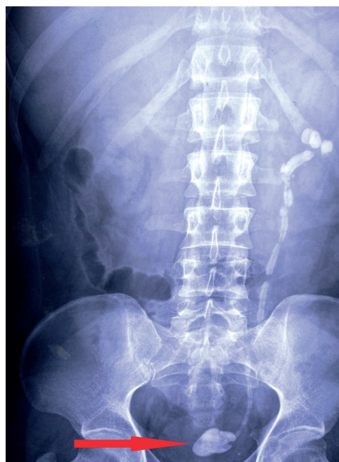
Figure 1 - X ray KUB image depicting completely encrusted double - J ureteral catheter with giant stone formation at distal bladder end resembling a "hockey - stick" (red arrow).

patients is mandatory to prevent long - term complications arising from prolonged in situ ureteral catheter such as worsening of hydronephrosis, infections, encrustations, stent migration and renal damage (1). Combined use of endourological approaches (CLT, URSL, PCNL etc.) may be required for successful management of forgotten and severely encrusted ureteral catheter (2). X ray KUB along with non - contrast computerized tomography (NCCT) can act as valuable imaging modalities