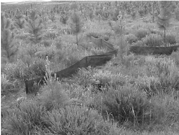
Fig. 2. Type locality of Melanophryniscus langonei sp. nov. In the photo one of the drift fences can be seen among the Pinus crops.

5.55, upper arm length (UAL) 5.04, forearm length (FAL) 5.2, hand length (HAL) 5.71.