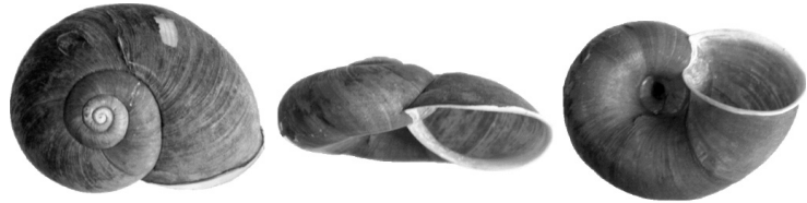
Figure 2. Shell of Macrocyclus peruvianus (Lamarck, 1822) in position, from left to right: dorsal, frontal and ventral. Scale, 1 cm.

Radula (Figs. 5-8). Has central, lateral and marginal teeth, presenting a variation among them. As of the disposition of the teeth, the marginal and lateral teeth are slightly inclined towards the central teeth, which have a rectilinear disposition. Unicuspid central teeth, oval and prolonged mesocone with slightly sharp posterior extremity; the posterior region stands out, convex and oval. Unicuspid lateral teeth, narrower mesocone and