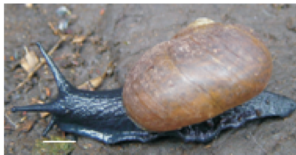
Figure 1. Macrocyclus peruvianus (Lamarck, 1822). Scale, 1 cm.