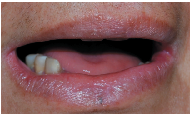
Figure 3- Limited mouth opening in a woman subjected to radiotherapy after a nasopharyngeal carcinoma 8 years before

observed and the mandible is most frequently involved (Figure 2). Associated symptoms of pain, trismus, and suppuration in the area of the lesion may also be present. The progression of this process can lead to pathologic fracture and intraoral and/or extraoral fistula 11 .