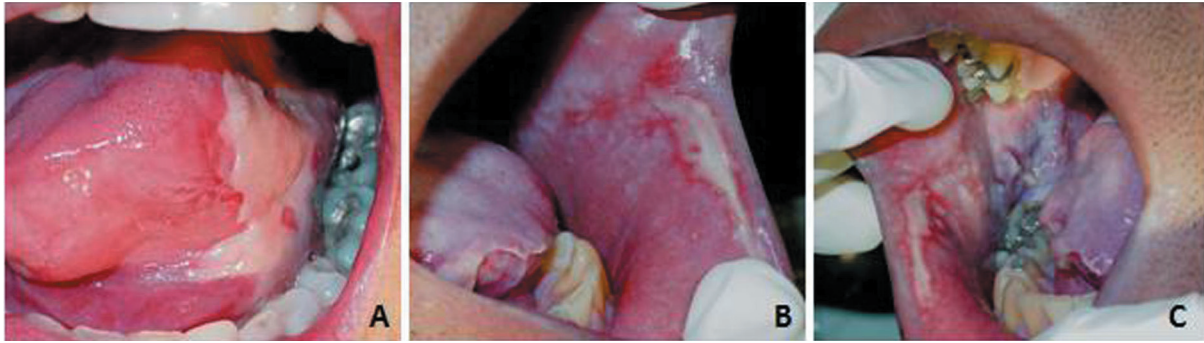
Figure 1- A: Mucosal atrophy and ulceration with pseudomembrane in the lateral tongue border; B and C: Diffuse erythema and ulceration with pseudomembrane in the tongue and lip mucosa of a patient subjected to head and neck radiotherapy