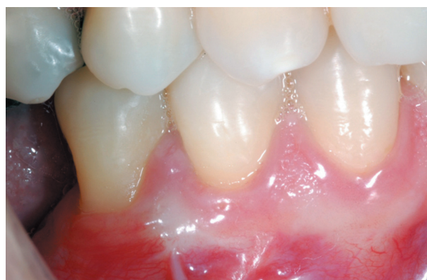
Figure 3- Buccal view of the area 9 months after treatment, suggesting gingival health and reduction of recession

Table 1 describes RD, PD, CAL, BOP, PI, KGW and the percentage of root coverage observed at buccal sites at baseline and at the postoperative examinations for all cases described. A reduction in RD was observed for all cases after 9 months, although Cases 2 and 3 showed a slight relapse from 3-month to 6- and 9-month examinations. All cases resulted in CAL gain and reduction or stability of PD measures, as well as absence of plaque accumulation and BOP. Cases 2, 3 and 4 showed a slight increase in KGW, while no change was observed in Case 1. Figure 3 shows the results obtained in Case 1, in which CAL gain was observed at interproximal and buccal sites, along