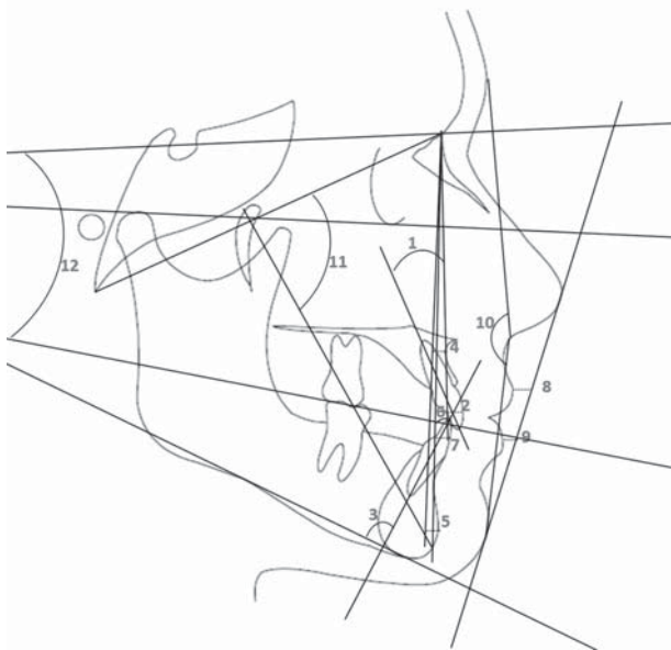
Figure 2- Cephalometric variables: 1, 1.Na; 2, 1-NA; 3, IMPA; 4, A-Nperp; 5, Pog-Nperp; 6, 1.NB; 7, 1-NB; 8, UL-E; 9, LL-E; 10, STC; 11, BaN/PtGn; 12, SN/Occlusal plane

Pearson's correlation analysis proved significant among the three methods studied (Table 3). Six