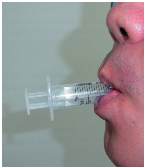
Figure 1- Collection of acetaldehyde. Participants kept their mouths closed for 3 min. The syringe was tightly held between lips to avoid contamination of the oral cavity with outside air

Probing pocket depth (PPD) and clinical attachment level (CAL) were determined at six sites (mesiobuccal, midbuccal, distobuccal, mesiolingual, midlingual and distolingual) on all teeth using a color-coded probe (Hu-Friedy, Chicago, IL, USA). Sites that bled upon gentle probing (25 g probing force) were recorded, and the proportion of sites with bleeding on probing (BOP) was measured in each participant. The plaque control record (PCR) was measured using erythrosine staining, and was recorded with respect to their relative location to the gingival margin at four sites (mesial, distal, buccal and lingual) around each tooth 22 . Tongue coating status was assessed according to distribution area as follows: score 0: none visible; 1: less than one