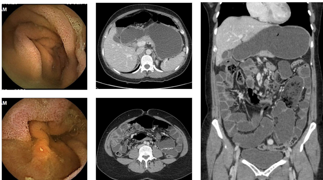
Fig. 2 – Capsule endoscopy and CT enterography images, 6 months after the acute event. Signs of pneumatosis are absent with few enteric stasis near the enteric anastomosis in CT enterography.

There are several theories to explain the secondary PCI pathogenesis 8 : mechanical theory, bacterial theory, pulmonary theory, and chemical theory. The mechanical theory suggests existence of air inflow through damaged mucosa, caused by intestinal obstruction, severe constipation, gastrointestinal ulcers, or intestinal necrosis, resulting in increased intestinal pressure. The bacterial theory suggests the invasion of gas-producing bacteria into intestinal submucosa, producing gas at the intestinal walls. The pulmonary