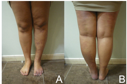
Figure 2. Disproportion between the second patient's lower limbs. (A) anterior view; (B) posterior view.