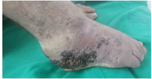
Figure 1. Verrucous nevi, lymphedema, venous angiodyplasia and angiokeratoma can be seen on the right lower foot.

of superficial and deep veins of the left lower limb, and an arteriovenous fistula, thereby confirming the diagnosis of PWS (Figures 3 and 4).