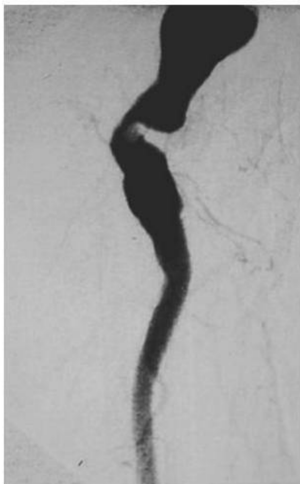
Figure 3 - Angiography showing sciatic artery with fusiform aneurysmal dilatation with stenosis in its proximal neck and following a descending route