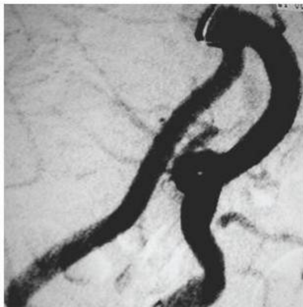
Figure 1 - Angiography showing dilatation of the right internal iliac artery

Due to risk of distal embolization and intense pain in the right lower limb, the patient was submitted to a surgical procedure, using a transgluteal approach to expose the sciatic artery aneurysm, being careful to identify and avoid sciatic nerve lesion. After dissection and clamping of distal and proximal necks, the aneurysm was open and a large thrombus was removed from the aneurysmal sac. There was no evidence of collateral vessels inside the aneurysm. A terminoterminal Dacron graft was interposed between the proximal and distal necks, and the aneurysmal sac was closed over the graft after part of it was removed. One month after the surgery, the patient reported pain relief and was submitted to arterial color flow Doppler ultrasound, showing graft patency.