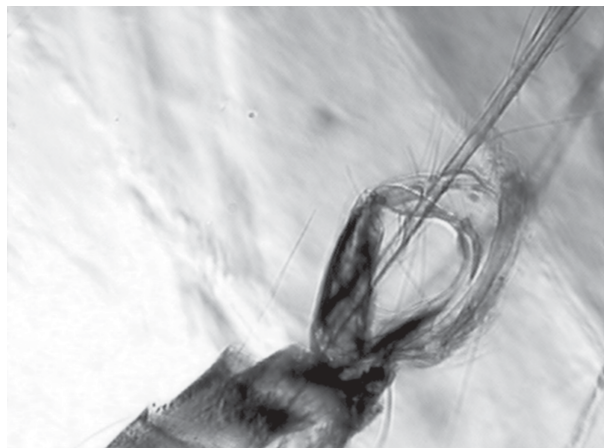
Fig. 1: Pintomyia (Pifanomyia) paleotownsendi sp. nov. in Dominican amber. Male genitalia 400 \times .

Abdomen: genital pump not visible. Gonostyle 78 long, with four spines: one apical, the external superior implanted close to the apical third, the external inferior in the middle of the structure and the internal one in the basal third.