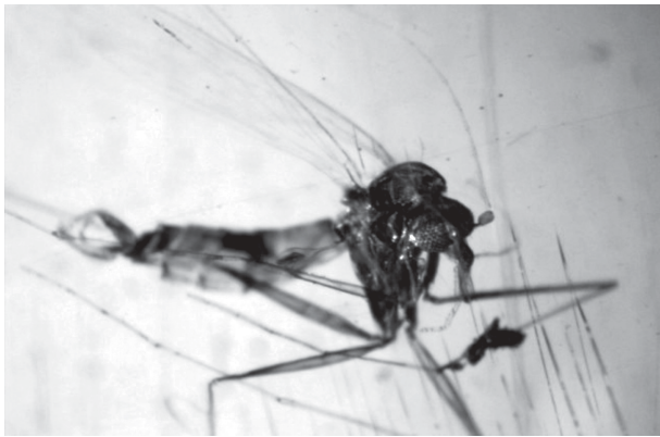
Fig. 3: Pintomyia (Pifanomyia) paleotownsendi sp. nov. in amber, holotype male, 200 \times .

Gonocoxite 182 long by 44 width, presents a central tuft with about five thin setae. Paramere 222 length, has a dorsal curvature in its apex, where it presents a group of small setae and also a short spine in its basal third. Lateral lobe longer than the gonocoxite.