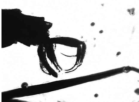
Fig. 2: Micropygomyia brandaoi sp. n. Terminalia