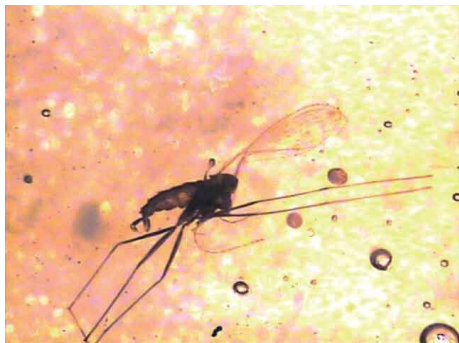
Fig. 1: Micropygomyia brandaoi sp. n. General aspect in amber.