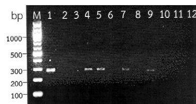
Fig. 1: gel electrophoresis showing positive polymerase chain reaction (PCR) products from cerebrospinal fluid (CSF) samples of four infected patients with serological positive angiostrongyliasis cantonensis (Lane 4: CSF2; 5: CSF3; 7: CSF5; 9: CSF7). Lanes 3 (CSF1), 6 (CSF4), 8 (CSF6), 10 (CSF8), 11 (CSF9) and 12 (CSF10) are negative for amplification products by PCR. Lane 1: positive control; 2: negative control (master mix); M: molecular weight markers (100-bp ladder).

The positive PCR amplification yielded a fragment of approximately 280 bp. PCR products were detected in four (CSF2, 3, 5 and 7) of the 10 CSF samples from patients showing clinical criteria of eosinophilic meningitis