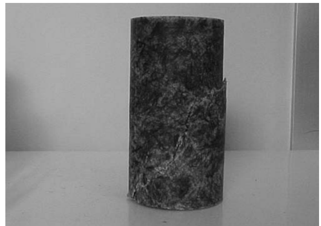
Figure 3. Epoxy, Glass and Carbon Fiber Polymer Concrete Specimens after Testing.