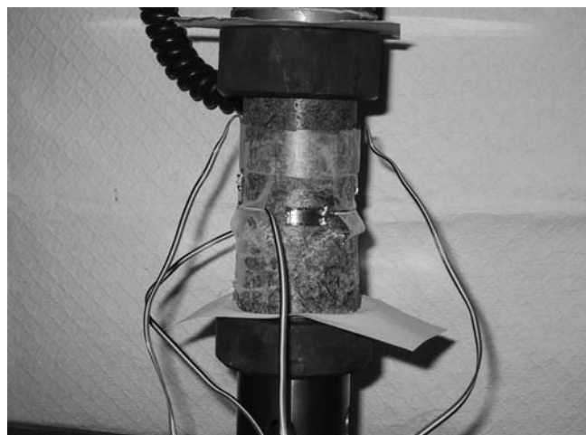
Figure 1. Compressive test specimens of Carbon fiber.