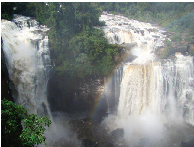
Fig. 4. The cachoeira Dardanelos at the município de Aripuanã, Mato Grosso State, Brazil. This fall is part of a series of close waterfalls descending about 150 m from its upper to the lower levels. This natural feature is known to be a biogeographic boundary for certain groups of fishes.

The unique pattern of spots exhibited by Hypostomus dardanelos allows a prompt identification of this species. The most typical pattern among Hypostomus and other species of Hypostominae is characterized by dark spots covering the whole dorsal surface of the body, and these spots become fainter and more widely spaced as approach the caudal fin. The color pattern displayed by H. dardanelos differs from the pattern detailed above due to be distinctly outlined, unvarying in size and having evenly spaced spots present throughout the whole dorsal surface of the body. Also the spots on the caudal peduncle are clearly restricted to its dorsolateral region. The unspotted area on the caudal peduncle is the most striking trait of this particular pattern. The species most similar to H. dardanelos are H. ericae (Fig. 5a), which inhabits the rio Tocantins-Araguaia basin in Tocantins State, Brazil and H. ericius (Fig. 5b), from the upper Amazon basin in Peru. However, H. ericae lacks strong keels supporting odontodes along lateral series of plates ( vs. keels present on both H. dardanelos and H. ericius ). The caudal fin is usually devoid of spots on its proximal region in H. dardanelos , in H. ericae , and in H. ericius . However, the caudal fin is usually spotted on the distal region in H. dardanelos and in H. ericae , while in H.