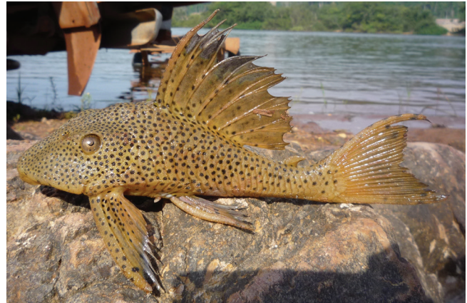
Fig. 3. Live specimen of Hypostomus dardanelos , MNRJ 36319, paratype, 145.5 mm SL, from the rio Aripuanã at the rapids downstream cachoeira Dardanelos, município de Aripuanã, Mato Grosso State, Brazil. Photographed immediately after capture by F. Pupo.

80° between left and right dentary rami. Teeth spoon shaped, apparently unicuspid; mesial cusp massive and round; lateral cusp extremely reduced and usually fused to mesial cusp (similar to the condition found in Hypostomus ericae ; Hollanda Carvalho & Weber, 2004: 640, fig. 4a).