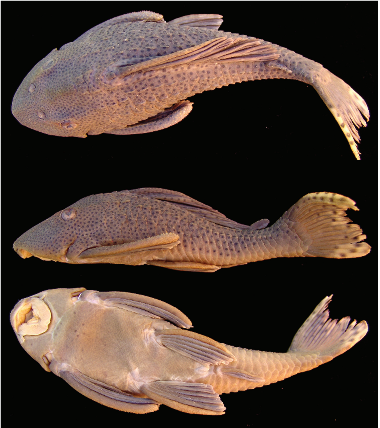
Fig. 1. Hypostomus dardanelos , INPA 37342, 172.2 mm SL, holotype, Brazil, Mato Grosso State, rio Praia Grande, tributary to rio Aripuanã, rio Madeira basin. Picture horizontally reversed.

Non-type specimens. NUP 14655, 1, 103.7 mm SL, Igarapé Arraia, tributary to rio Aripuanã, 10°07'15"S 59°31'42"W, 19 Jan 2013, H. P. Silva & C. H. Zawadzki. NUP 14656, 1, 66.8 mm SL, Igarapé Guaribal, tributary to rio Aripuanã, 10°08'51"S 59°29'56"W, 19 Jan 2013, C. H. Zawadzki & H. P. Silva.