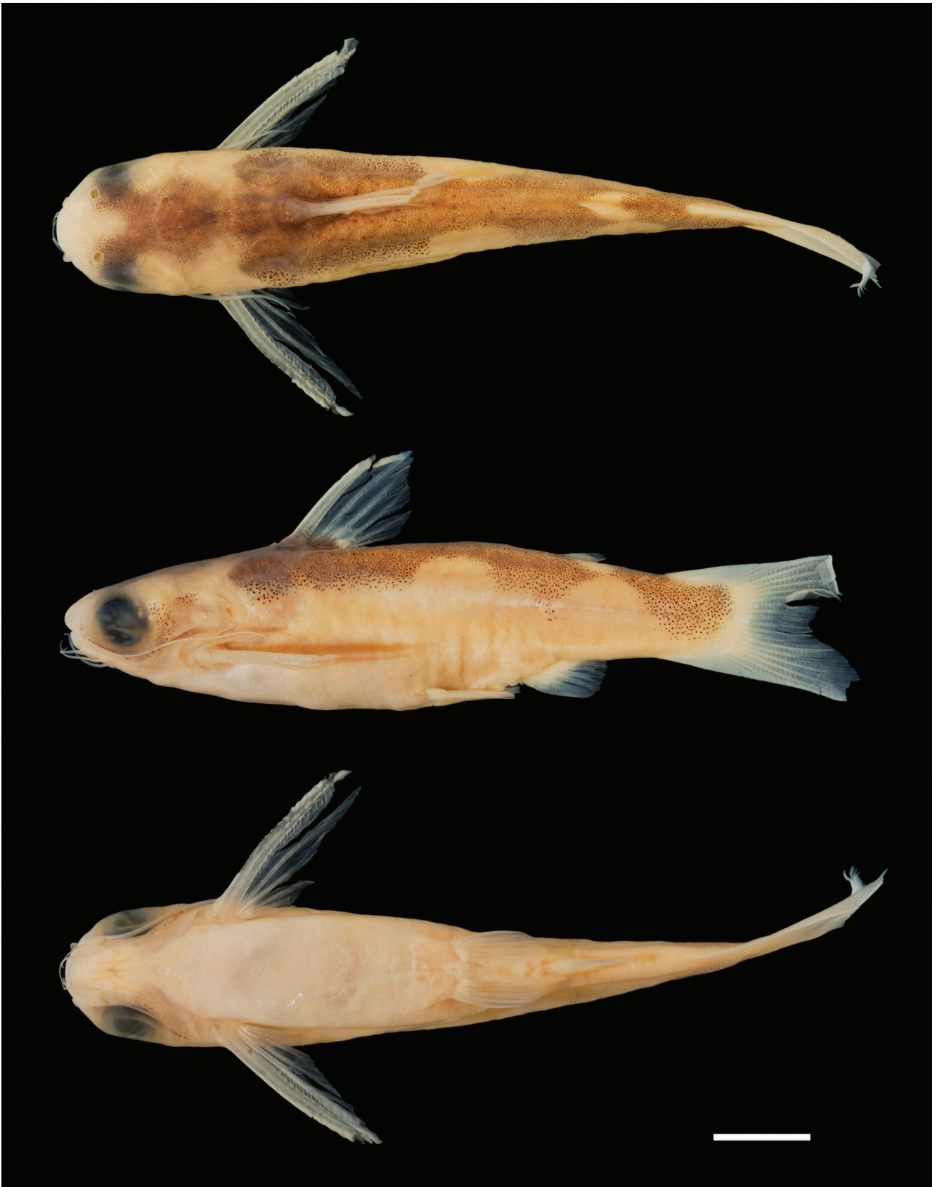
Fig. 1. Tatia melanoleuca , new species, MZUSP 114670, holotype, female, 32.4 mm SL, Brazil, along border between Pará and Mato Grosso states, Jacareacanga, rio Teles Pires, close to Sete Quedas, upper rio Tapajós basin; dorsal, lateral and ventral views. Scale bar = 0.5 cm.