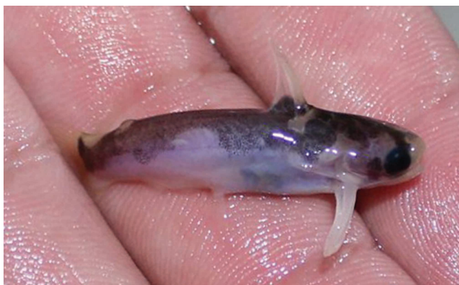
Fig. 2. Life coloration of specimen of Tatia melanoleuca collected in rio Jamanxim, tributary to upper rio Tapajós basin.

Distribution. Examined specimens of Tatia melanoleuca all originated from the rio Teles Pires in the rio Tapajós catchment in the southern portion of the Amazon basin (Fig. 3). Photographed (but not vouchered) evidently conspecific specimens originated in the rio Jamanxim (see Color in Life above), a right bank tributary of the rio Tapajós immediately north of the rio Teles Pires.