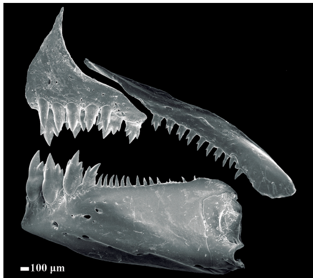
Fig. 2. Boehlkea weitzmani , INPA 48541, 32.8 mm SL, paratype. Scanning electron micrograph of left side upper and lower jaws. Scale bar = 100 \mu m.

Color in alcohol. Overall ground color of body pale yellow. Upper jaw, anterior portion of maxilla, snout, top of head and dorsal portion of opercle with dense concentration of small dark chromatophores. Lower jaw, gular area and infraorbitals clearer. Dorsal surface of body with dark chromatophores from posterior region of supraoccipital spine to caudal peduncle, resulting in dark stripe on the dorsum. One conspicuous humeral spot vertically oriented, extending horizontally from second through third lateral-line scales,