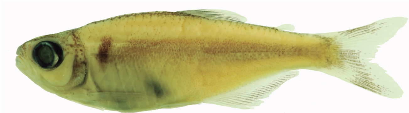
Fig. 1. Holotype of Boehlkea weitzmani , INPA 53202, 33.7 mm SL, male, rio Japurá basin, Amazonas State, Brazil.

Supraneurals 5(4), "I"-shaped. Precaudal vertebrae 15(3) or 16(1); caudal vertebrae 21(2), 22(1) or 23(1); total vertebrae 36(1), 37(2), or 38(1). First gill arch with 5(3) or 6*(25) gill-rakers on upper limb and 8(1), 9(3), 10*(20), or 11(4) on lower limb.