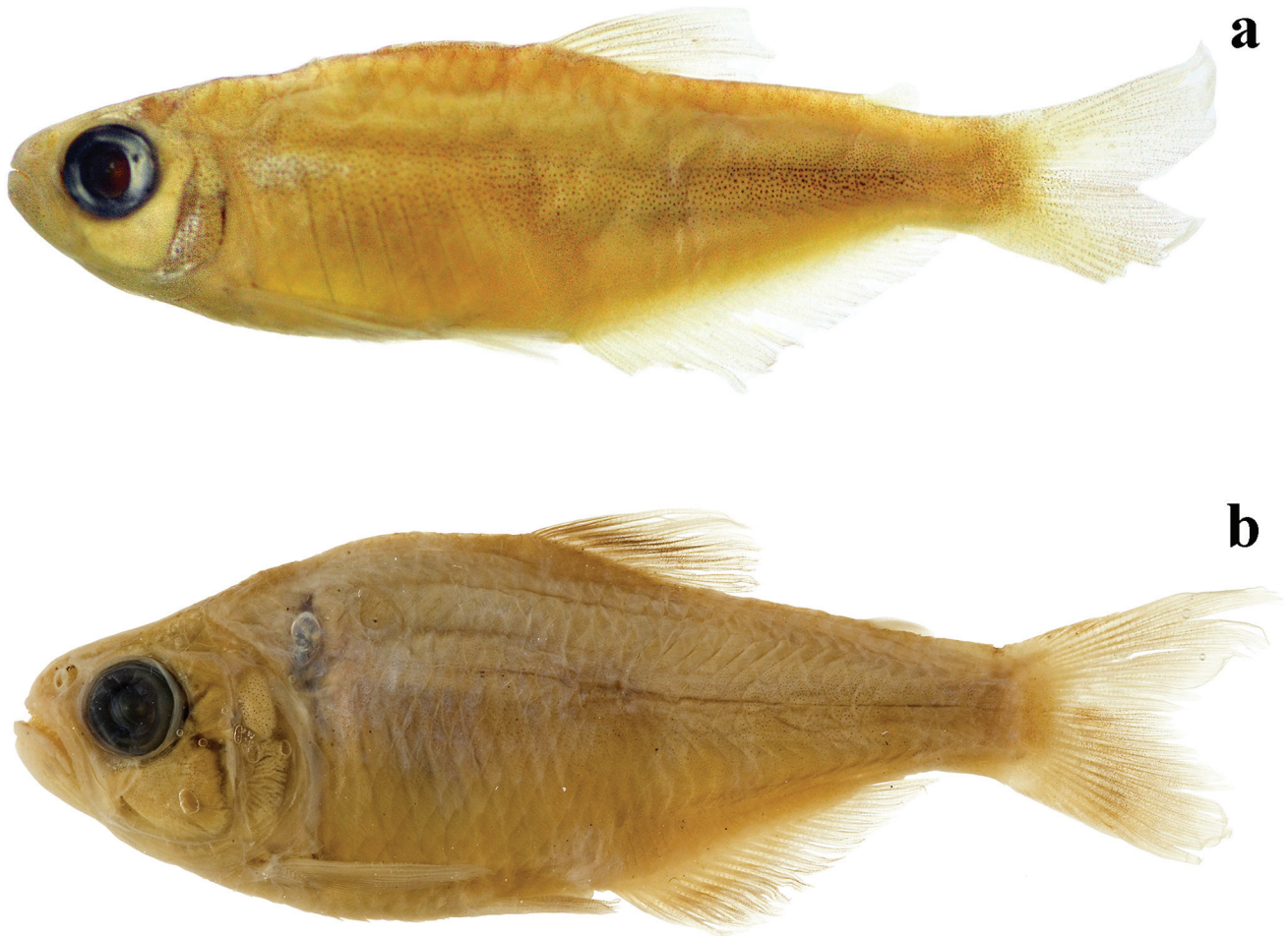
Fig. 6. a. Paratype of Boehlkea fredcochui , ANSP 111668, 31.8 mm SL, upper Amazon from surroundings of Leticia, Colombia; b. Holotype of Boehlkea orcesi , USNM 164064, 47.4 mm SL, río Macuma, northern tributary of upper rio Morona, upper Amazon, Santiago-Zamora, Ecuador.

Comparative material examined. Boehlkea fredcochui . ANSP 111675, holotype, male (x-ray), 39.3 mm SL. ANSP 111668, paratype, male, 31.8 mm SL. ANSP 111676, 1 of 2 paratypes, 29.8 mm SL. Hemibryon orcesi . USNM 164064, holotype, male (x-ray), 47.4 mm SL. ANSP 75904, 2 paratypes (x-ray), 44.2-45.5 mm SL. USNM 175128, 1 paratype (x-ray), 48.7 mm SL.