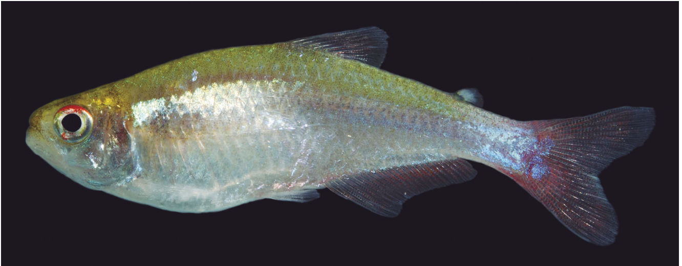
Fig. 3. Boehlkea weitzmani , unsexed, live specimen, rio Japurá basin, Amazonas State, Brazil (specimen not cataloged).

Sexual dimorphism. Mature males of Boehlkea weitzmani have slightly curved bony hooks on the pelvic- and anal-fin rays. Pelvic fin has one hook per segment, which are arranged on the distal portion of the first to fifth (rarely on the sixth) branched rays. One or two pairs of hooks per segment located on the distal portions of the last unbranched anal-fin ray and up to the eighth or ninth (sometimes tenth) branched anal-fin rays.