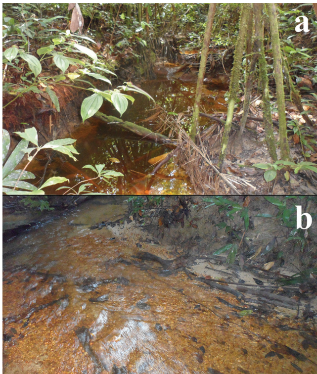
Fig. 5. Type-locality of Boehlkea weitzmani , tributary of the rio Japurá, Amazonas State, Brazil: a. small stream from right margin of rio Japurá, with litter banks; b. small stream from left margin of the river, predominantly composed by pebbles and sand.