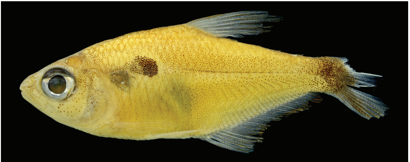
Fig. 1. Phenacogaster julliae , MZUSP 123642, holotype, unsexed, 27.4 mm SL, rio Salitre, Bahia state, Brazil.

sympatric in the rio São Francisco basin, and Phenacogaster calverti Fowler of the coastal rivers of northeastern Brazil, immediately to the north of the rio São Francisco. In addition to the clearly differentiating feature mentioned earlier, P. julliae differs from P. franciscoensis in having a humeral spot in contact with, or slightly anterior to, the posterior margin of the pseudotympanum, corresponding to the posterior limit of the second rib, or immediately anterior to it (= to the first rib in Lucena, Malabarba, 2010) (vs. humeral spot distant from posterior margin of pseudotympanum by at least one scale, situated from the third rib, or immediately in front of the third rib); P. julliae differs from P. calverti in having a small third infraorbital, distant from the horizontal and vertical margins the preoperculum (vs. a large third infraorbital, with posterior margin reaching the vertical margin of preoperculum and lower margin separated from the horizontal margin of preoperculum by a small space); two or three teeth in the medial region of the external premaxillary row (vs. one, rarely two); and the gently curved snout (vs. usually abrupt snout).