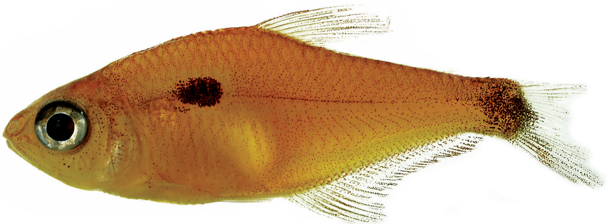
Fig. 2. Phenacogaster julliae , MZUSP 51375, paratype, male, 26.3 mm SL, rio Salitre, Bahia state, Brazil.