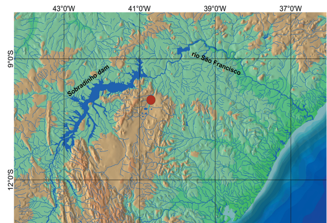
Fig. 4. Known distribution of Phenacogaster julliae . Red dot represents the type locality.

noticeable aquatic vegetation, transparent water, and slow flow, alternating between shallow areas with rapid flow and other slower, deeper areas reaching a depth of about 2 m. We do not have information on current conditions of the locality; however, the rio Salitre basin, which has a history of conflict over water use, faces various threats: incompatible irrigation methods, development of soil cultivation on the banks of the rivers and lakes of dams, superficial water with a high level of salinity and pollution caused by anthropic activity (untreated sewage, among others) (FEP, 2003). Furthermore, there are transposition projects, specifically the Sertão Baiano or Eixo-Sul Canal [transposition of the rio São Francisco] that runs from the rio São Francisco, starting from the Sobradinho Reservoir to the rio Itapicuru and Jacuípe water basins, influencing some basins along this path, including the Salitre (Nemus, 2015). Considering these threats faced by the rio Salitre basin and the apparent rarity of the species, Phenacogaster julliae can be categorized as Data Deficient according to the IUCN criteria (IUCN, 2017).