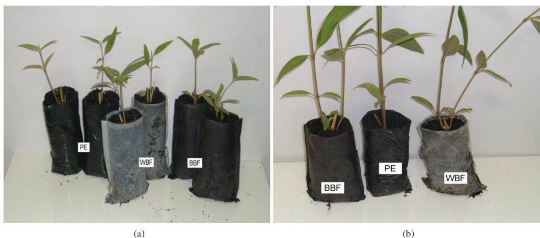
Figure 2. Brazilian ginseng seedlings 30 days after planting in PE, WBF and BBF bags (a); Brazilian ginseng seedlings 60 days after planting in BBF, PE and WBF bags (b).

three treatments (with the entire bag, with the bottom cut off and without the bag). The dry mass of the roots of the plants was measured, and a visual inspection of the biodegradation of the films was performed.