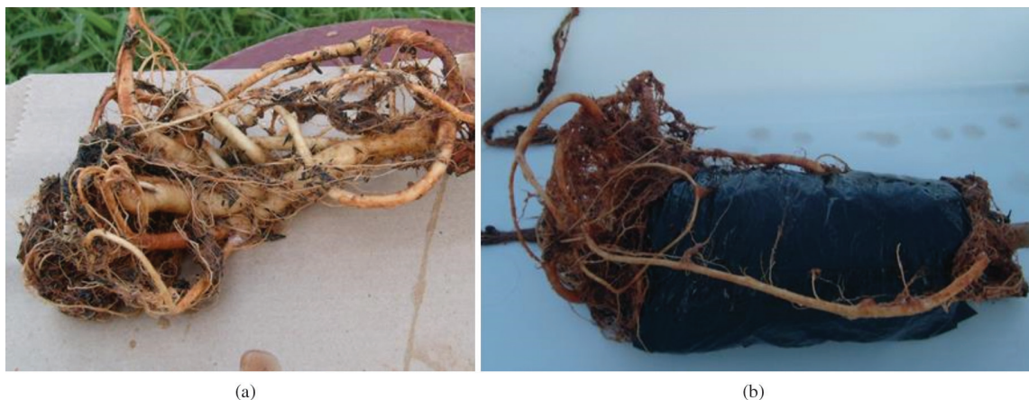
Figure 4. Evaluation 240 days after planting the BBF (a) and PE (b) bags. Black biodegradable film (BBF).

a,b Averages with different letters in the same line indicate a statistically significant difference at the 0.05 level by the Tukey test. A,B Averages with different letters in the same column indicate a statistically significant difference at the 0.05 level by the Tukey test. White biodegradable film (WBF); Black biodegradable film (BBF).