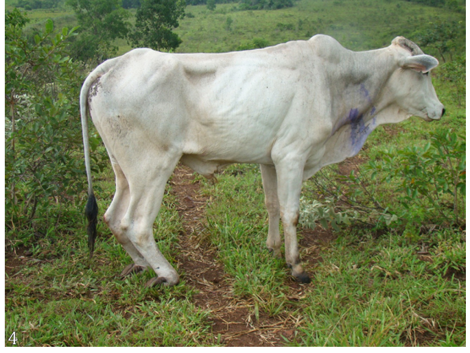
Fig.4. Peripheral neurodegenerative disease in cattle. Hyperflexion of the fetlock joints, with support on the pastern of both limbs.

has also been reported. In this specific case, collecting blood from live cattle for serum calcium measurement is essential since the diagnosis is made based on the clinical picture, elimination of other causes, detection of low serum calcium levels, and response to treatment (Constable et al. 2017). Urea poisoning has an acute course and occurs after cattle consume large quantities of the product, which die quickly, often around troughs (Barros et al. 2006). Organophosphate poisoning can have an acute, subacute, or chronic course. In acute poisoning, cases occur shortly after the application of products containing organophosphates. In subacute and chronic cases, the effects of intoxication occur later, producing clinical signs that are easily confused with botulism (Barros et al. 2006). Another differential diagnosis is poisoning by Amorimia pubiflora, a plant that contains monofluoroacetic acid and causes sudden death. Poisoned cattle are found dead or show clinical signs and death shortly after they are moved. Gross lesions are nonspecific; however, in some cases, microscopic lesions located in the kidneys are present and are characterized by hydropic-vacuolar degeneration and karyopyknosis in epithelial cells of the uriniferous tubules (Tokarnia et al. 2012).