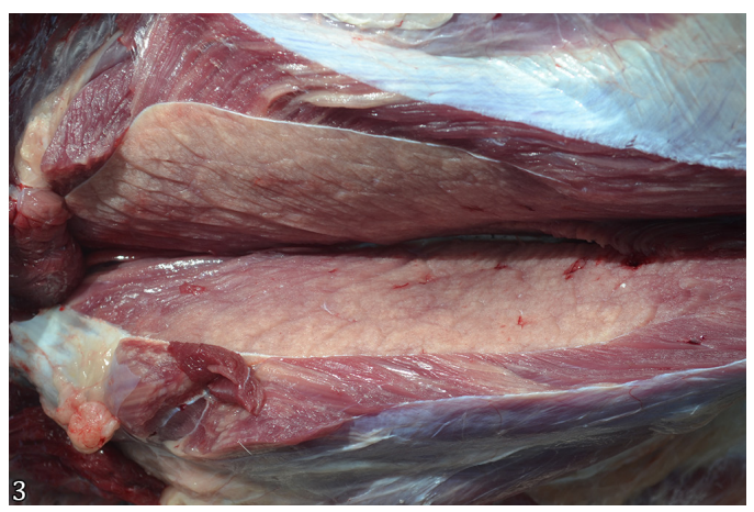
Fig.3. Necropsy findings in Senna sp. poisoning in cattle. Extensive pallor area in skeletal muscle corresponds to myofiber necrosis under microscopy.

Hypothermia, hypocalcemia, urea, and organophosphate toxicosis are diseases that do not cause gross and microscopic changes in affected cattle. One should rely on epidemiological characteristics to differentiate them from botulism. Cases of hypothermia cause the simultaneous death of a large number of cattle on different properties, often in other regions of the state, always associated with sudden drops in temperatures, gust winds, and rain (Santos et al. 2012). Hypocalcemia occurs in cows in the postpartum period, uncommonly in the form of outbreaks (Barros et al. 2006). Hypocalcemia associated with the consumption of plants with high levels of oxalates